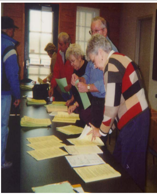
Town of Eileen volunteers organize family histories for the celebration.